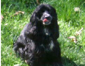
OBG's "Girls of Summer" (Top to bottom) Harper, Chelsea, and Kiwi

dementia and needs help to care for himself, so he had no choice but to move with all three dogs to a new location. Sadly, he was not able to keep the dogs inside with him when he moved and they were forced to live outside in a very small pen covered with a tarp. Can you just imagine how hot it must have been for those poor girls with the tarp trapping the heat inside their pen?